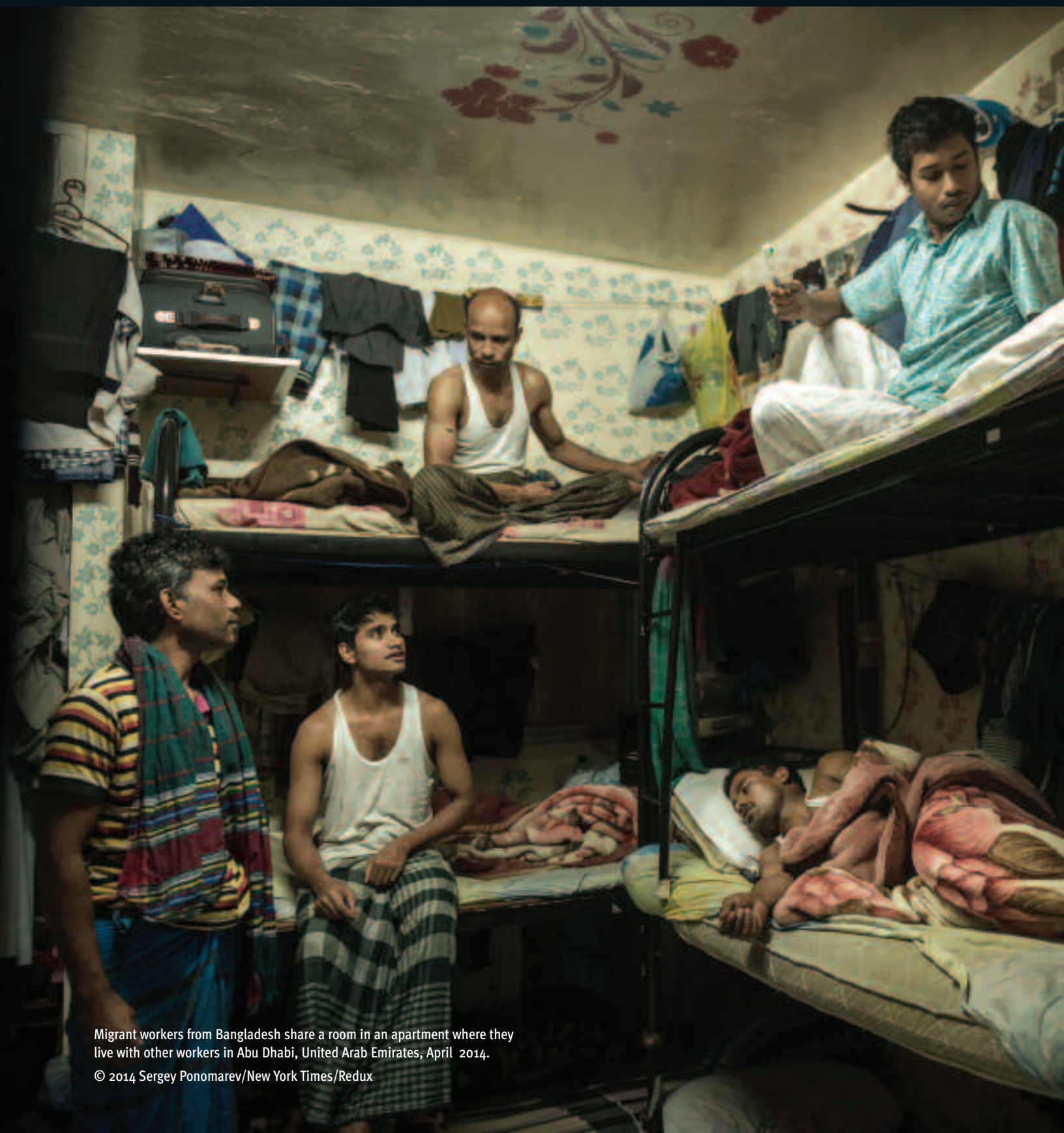
Migrant workers from Bangladesh share a room in an apartment where they live with other workers in Abu Dhabi, United Arab Emirates, April 2014.