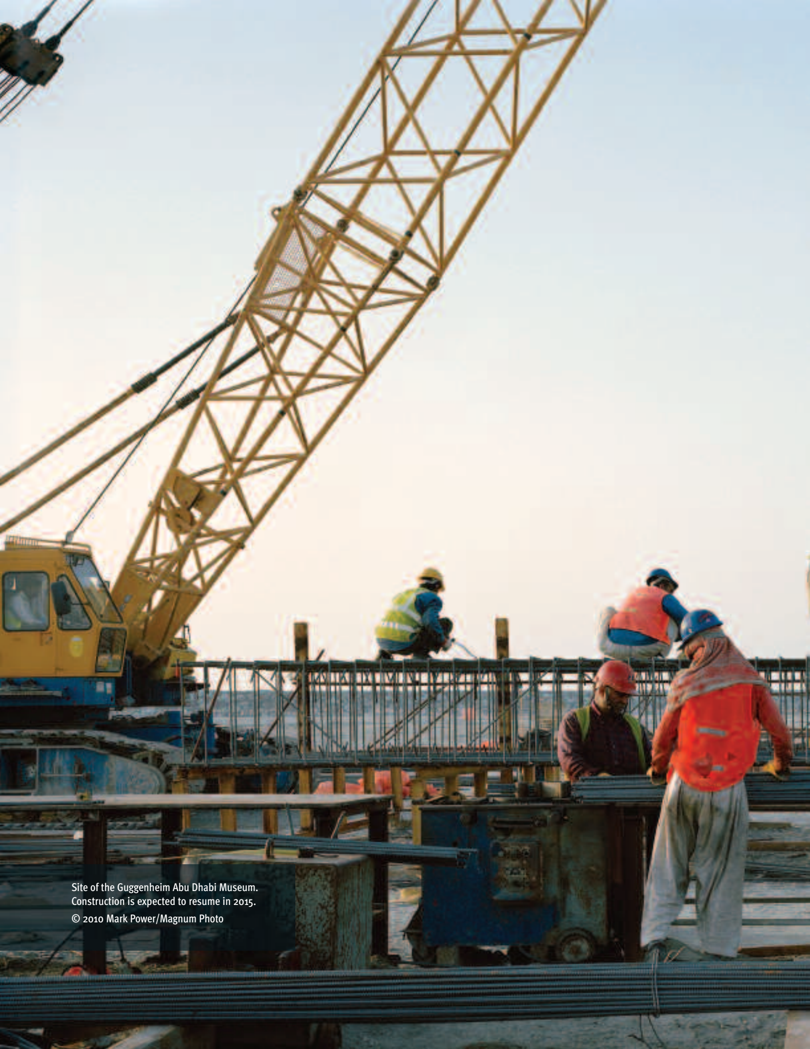
Site of the Guggenheim Abu Dhabi Museum. Construction is expected to resume in 2015.