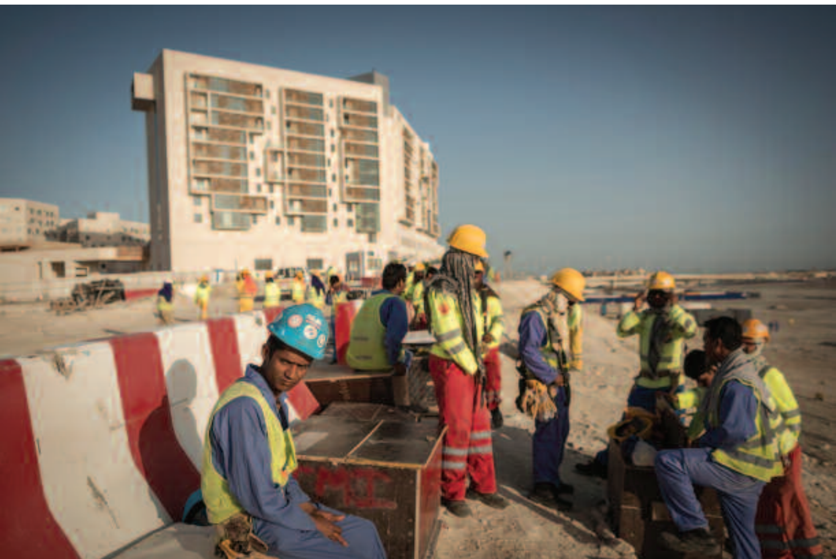
Migrant workers from Bangladesh share a room in an apartment where they live with other workers in Abu Dhabi, United Arab Emirates, April 2014.